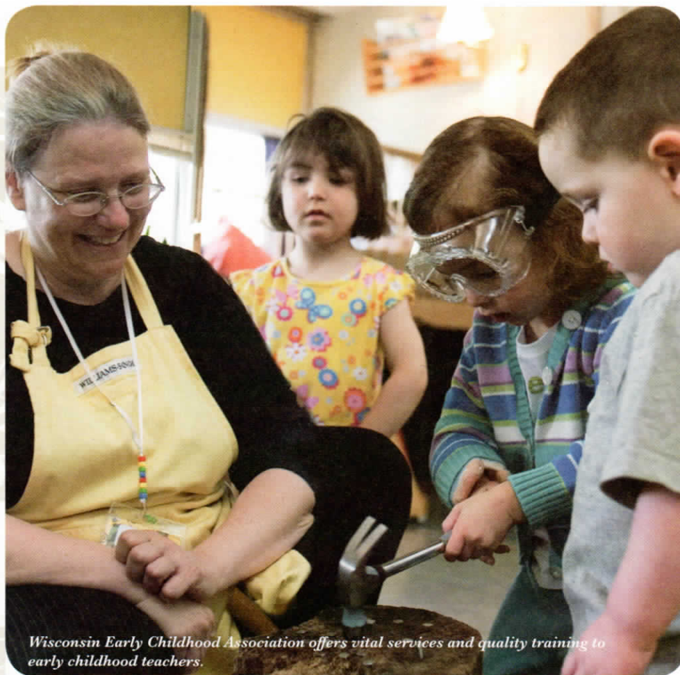
Wisconsin Early Childhood Association offers vital services and quality training to early childhood teachers.