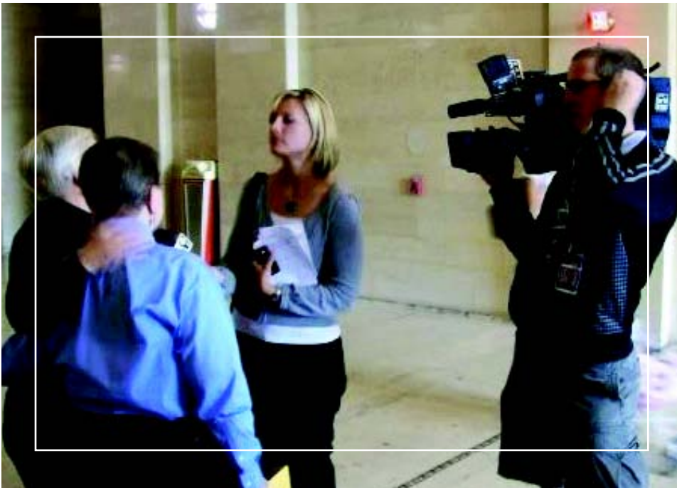
Fair Wisconsin Education Fund helped drive passage of the state's domestic partnership registry.