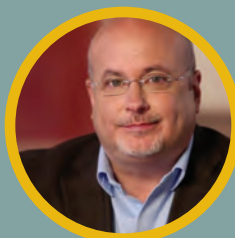
Mark Pocan US Representative, Wisconsin 2nd District